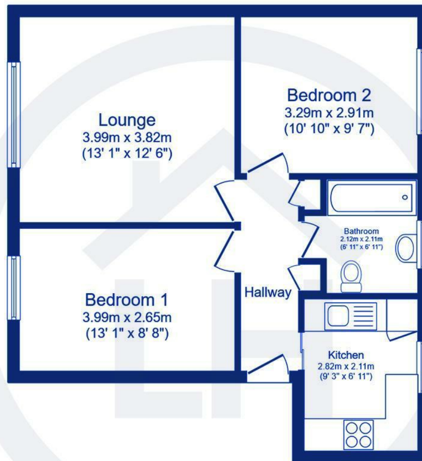
Floor Plan Floor area 51.7 m 2 (556 sq.ft.)